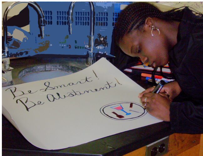
Making a poster during an ULTRA Teen Choice Service Club Meeting

Interested 10 th to 12 th grade ULTRA Teen Choice Service Club members can apply to be peer counselors to the 9 th grade youth. They tell, and show by example why the abstinent lifestyle is the best one. The 9 th grade youth are then invited to join with them in making a commitment to be abstinent, and to be members of the ULTRA Teen Choice Service Club. For Middle Schools and Junior High Schools, 7 th and 8 th or 8 th and 9 th graders counsel the 6 th and 7 th grade youth, respectively.